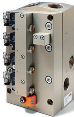
Blowing Block BigBottle TFM