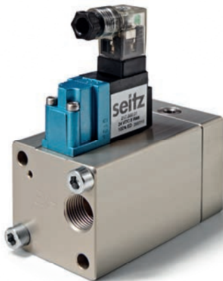
Compensation Valve Compensa IV