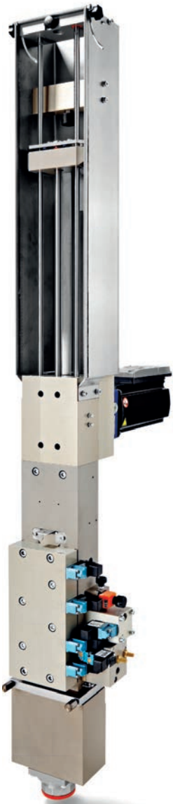
Integrated Blowing Station