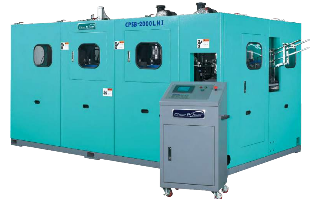
油瓶把手前置拉吹機 PET Stretch Blow Moulding Machine With Handle Pre-Insert