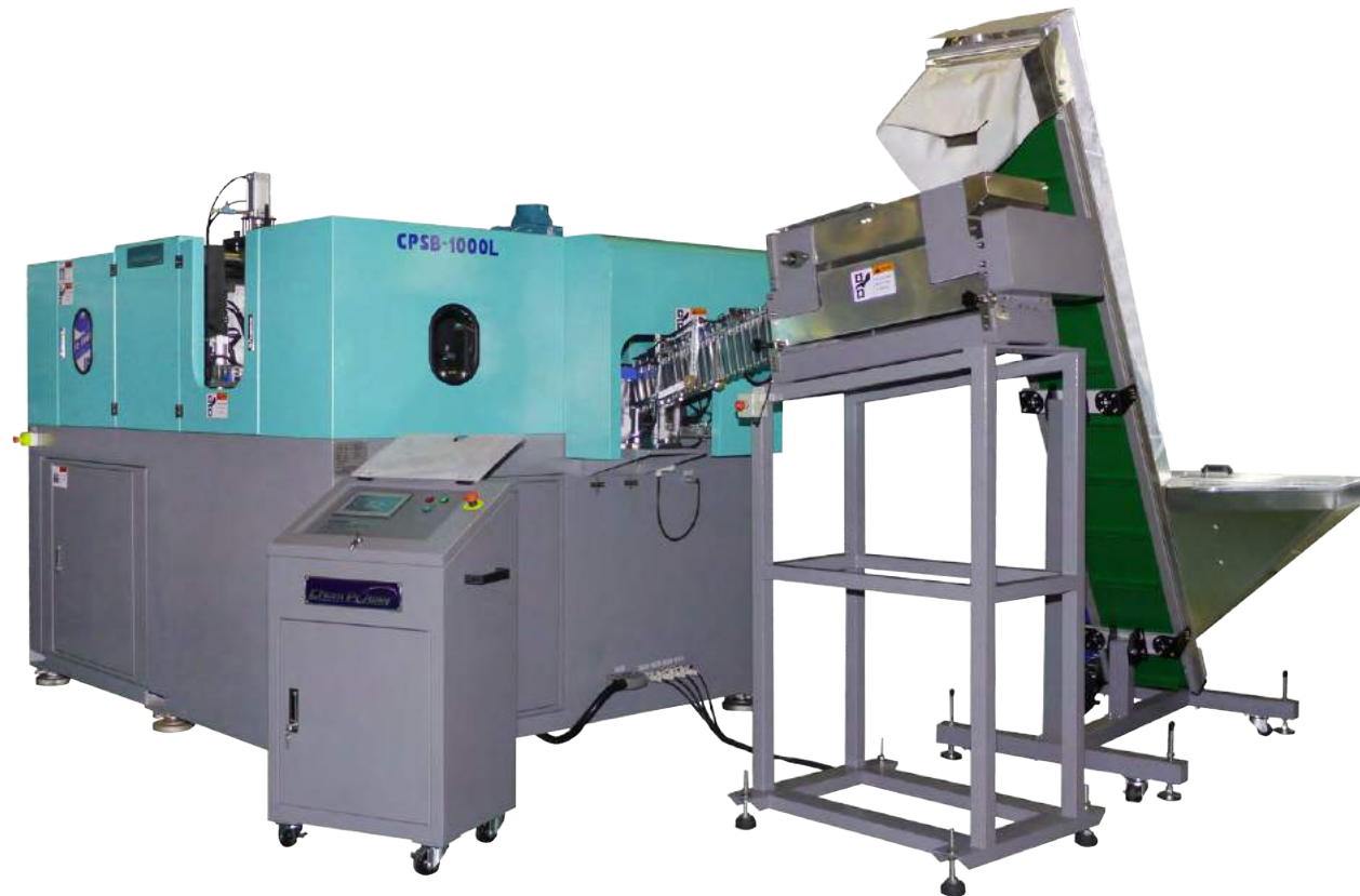
大容量水瓶拉吹機 PET Stretch Blow Moulding Machine