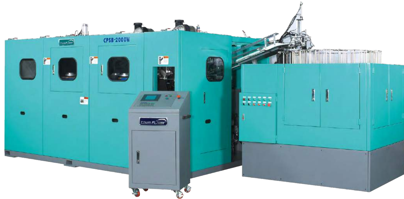
廣口瓶拉吹機 PET Wide-Neck Jar Blow Moulding Machine