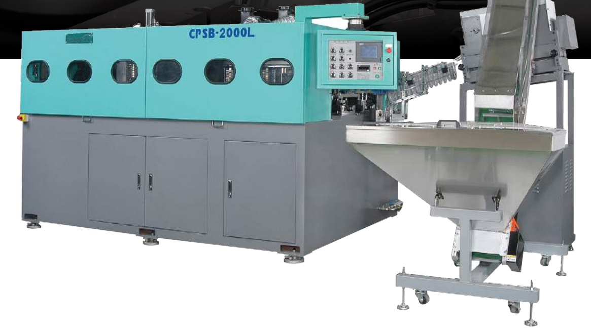
銓寶 廣口與大容量系列 PET 雙軸延伸拉吹機

W/L SERIES For Large Volume, Oval & Flat Bottles and Wide-Neck Jar PET Stretch Blow Moulding Machine